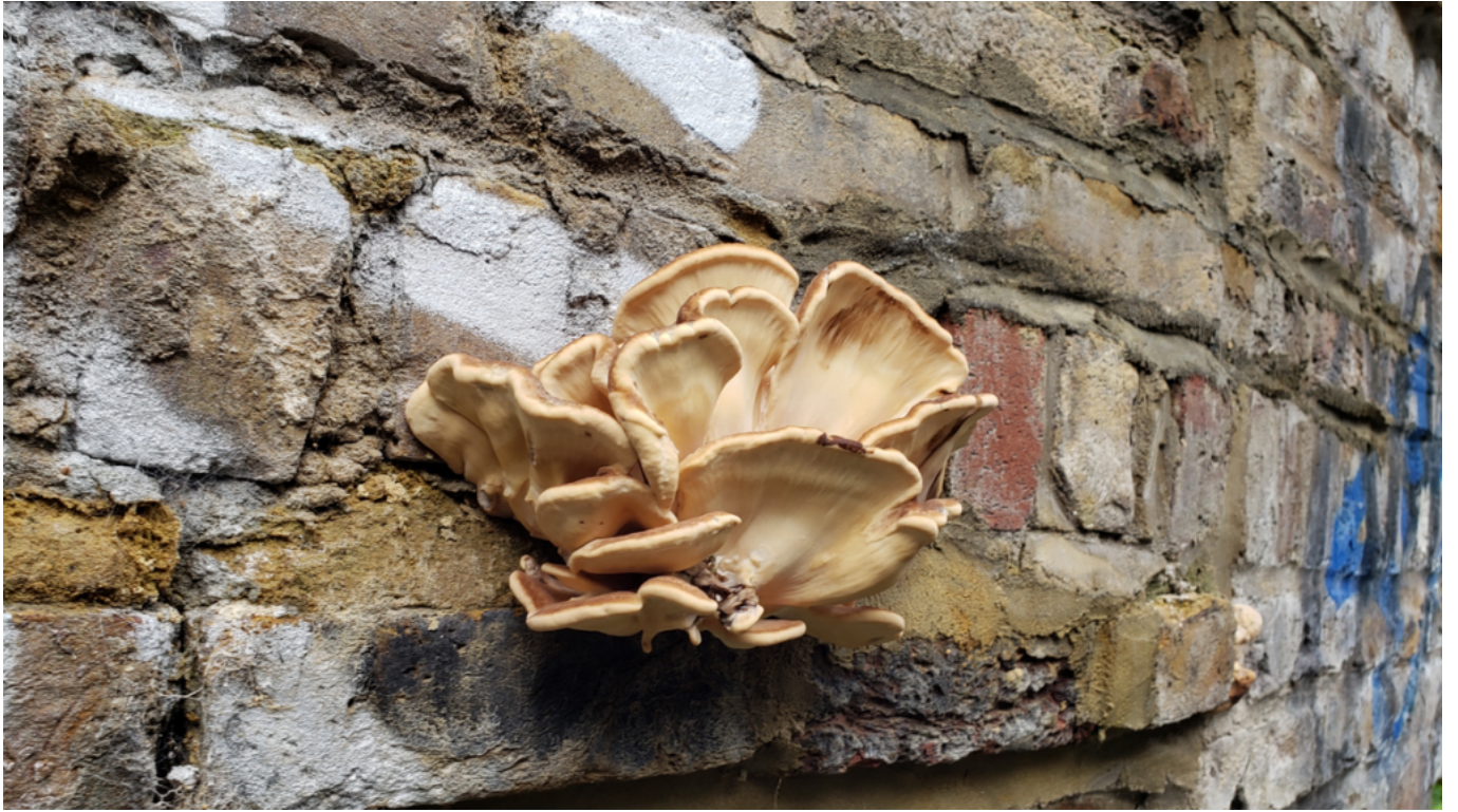
A spectacular shelf fungus along Regent's Canal