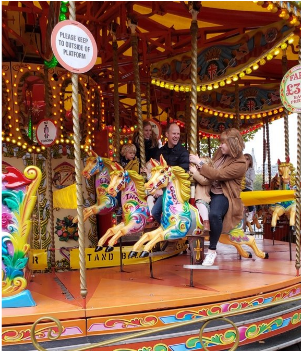
Anonymous family enjoying the merry go round on Southbank