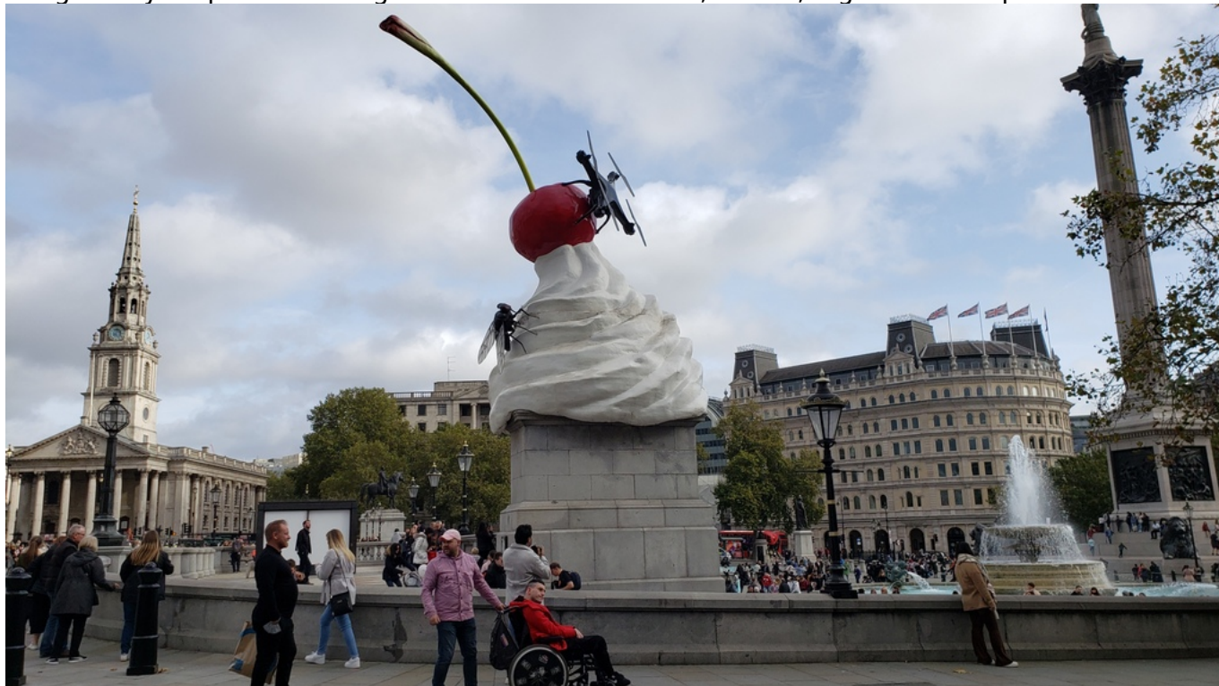
The Fourth Plinth installation, Trafalgar Square

I honestly had assumed that this was not a statue but a street performer. It's such a classic pose for one of those fake statuary so popular around Leicester Square and Covent Garden. Imagine my surprise when I got closer and saw it was, in fact, a genuine sculpture.