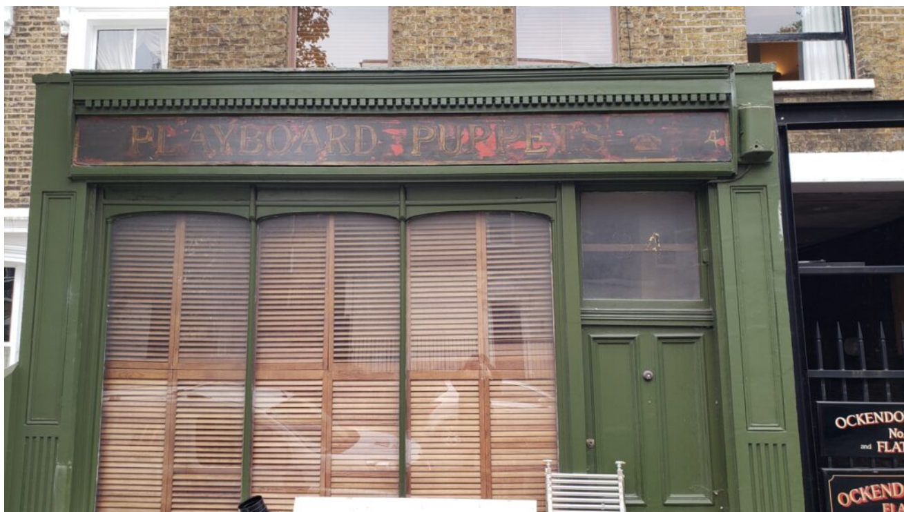
Storefront on Ockendon Road, Islington