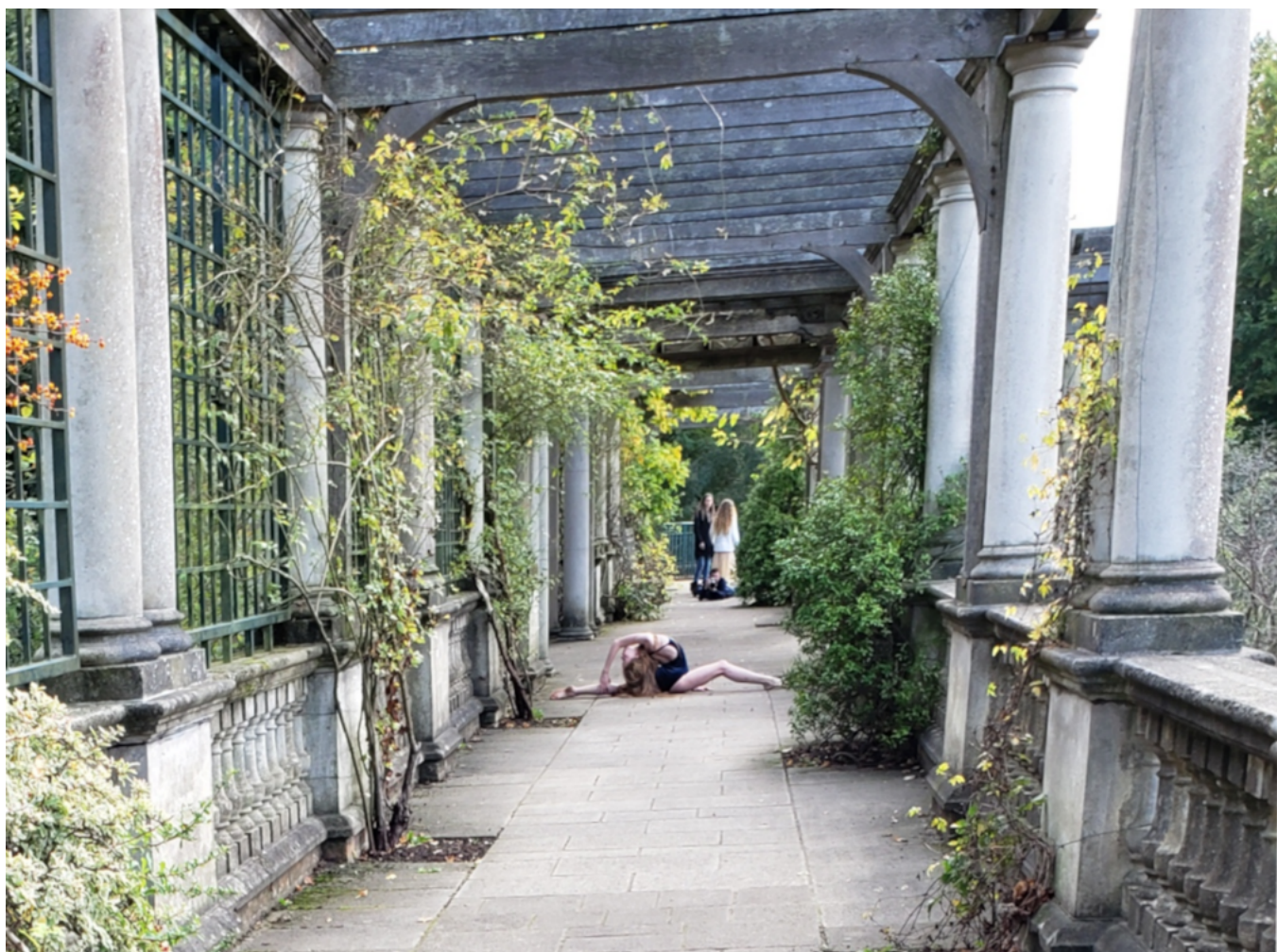
A photo shoot was going on

Copyright © 2025 Fortune's Pawn . This Feed is for personal non-commercial use only. If you are not reading this material in your news aggregator, the site you are looking at is guilty of copyright infringement. Please contact legal@www.fortunespawn.com so we can take legal action immediately.