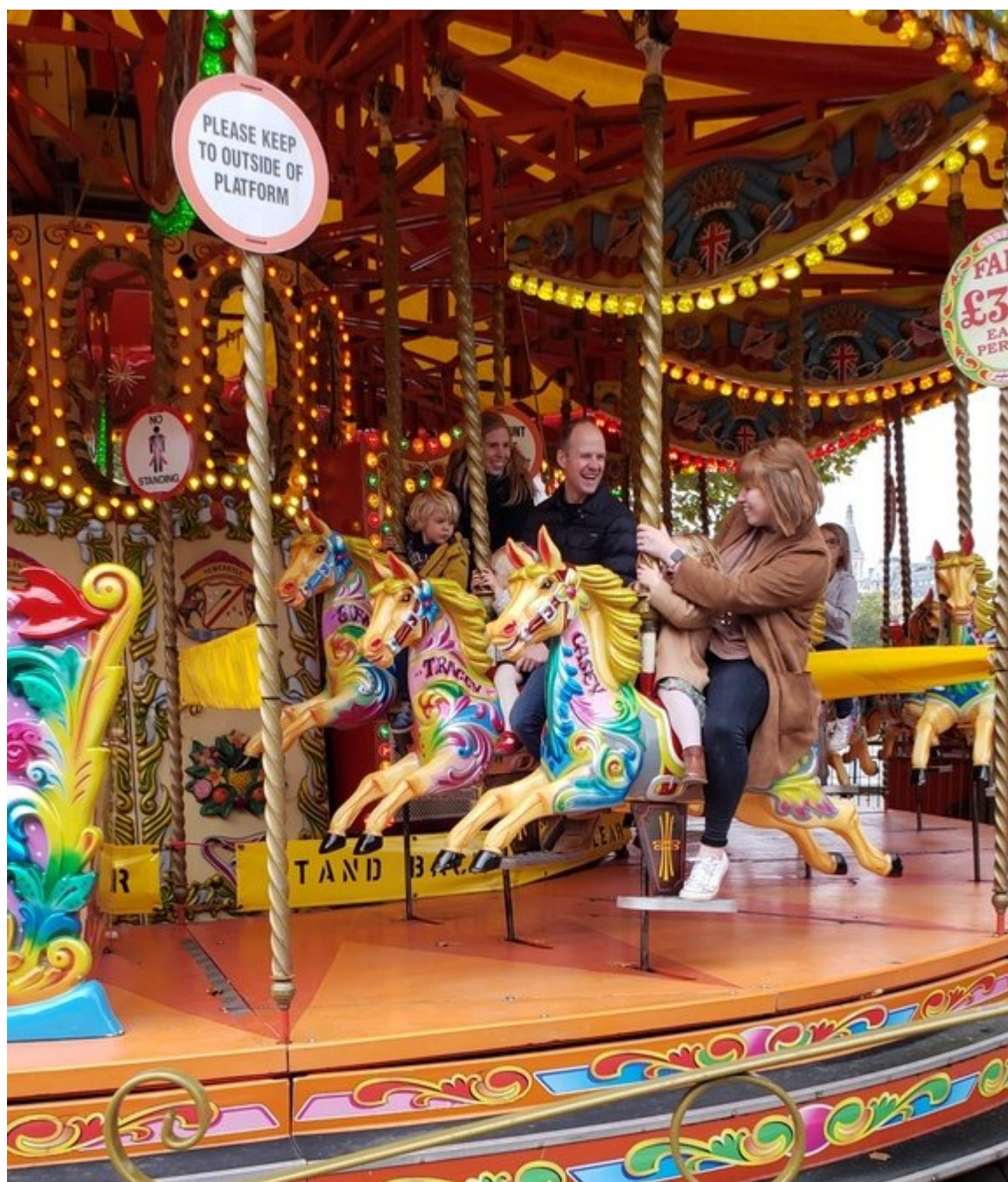
Anonymous family enjoying the merry go round on Southbank