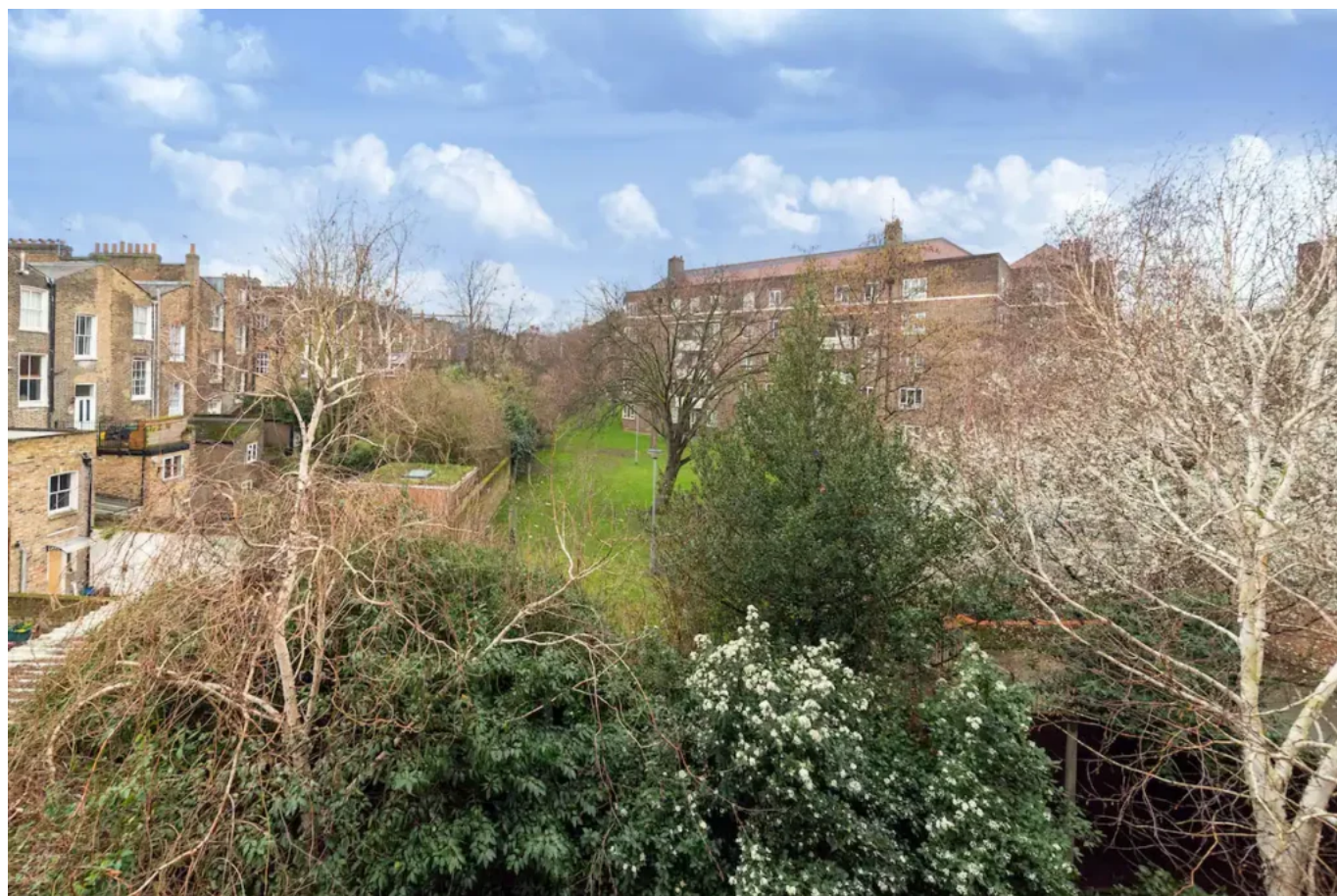
The view out the windows