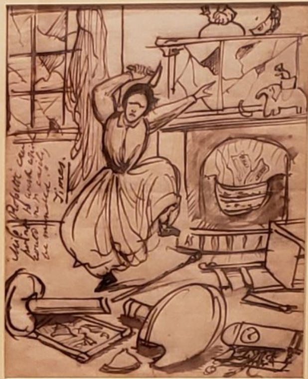
Christina Georgina Rossetti in a Tantrum, 1862, by Dante Gabrielle Rossetti