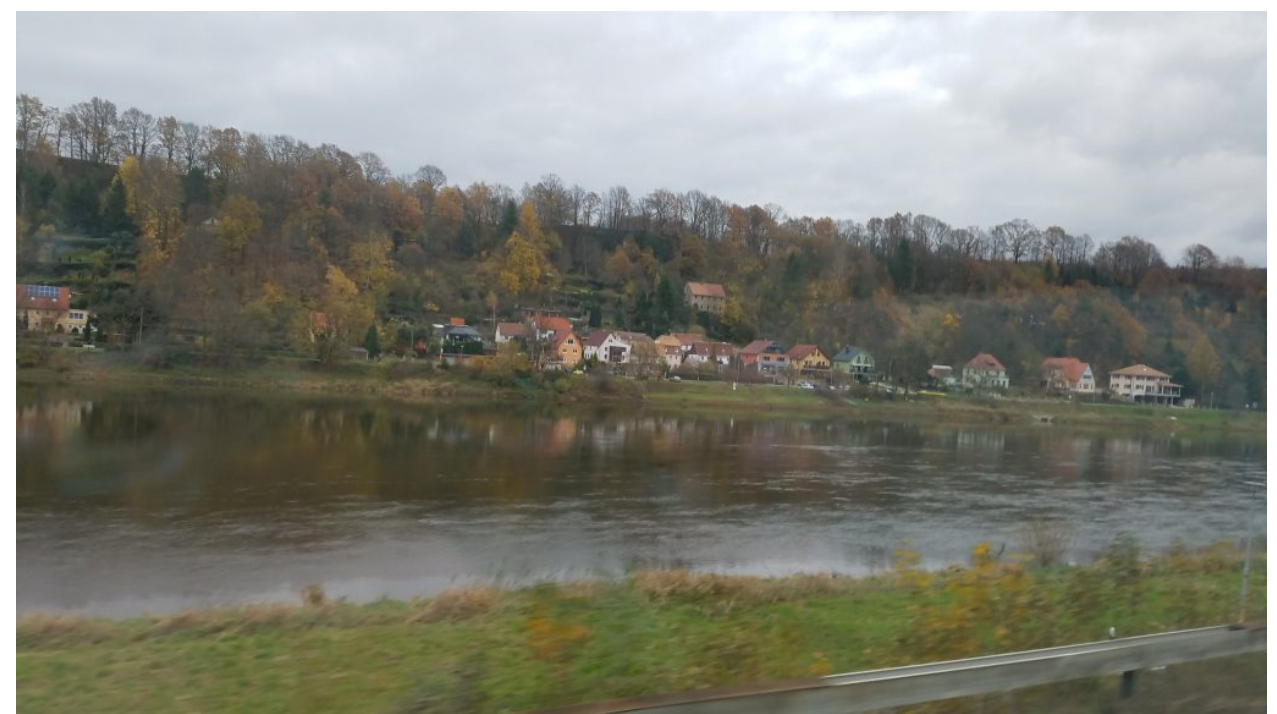
Rounding a long curve, my gaze was drawn to the nearby hilltop, and the old mine buildings there.