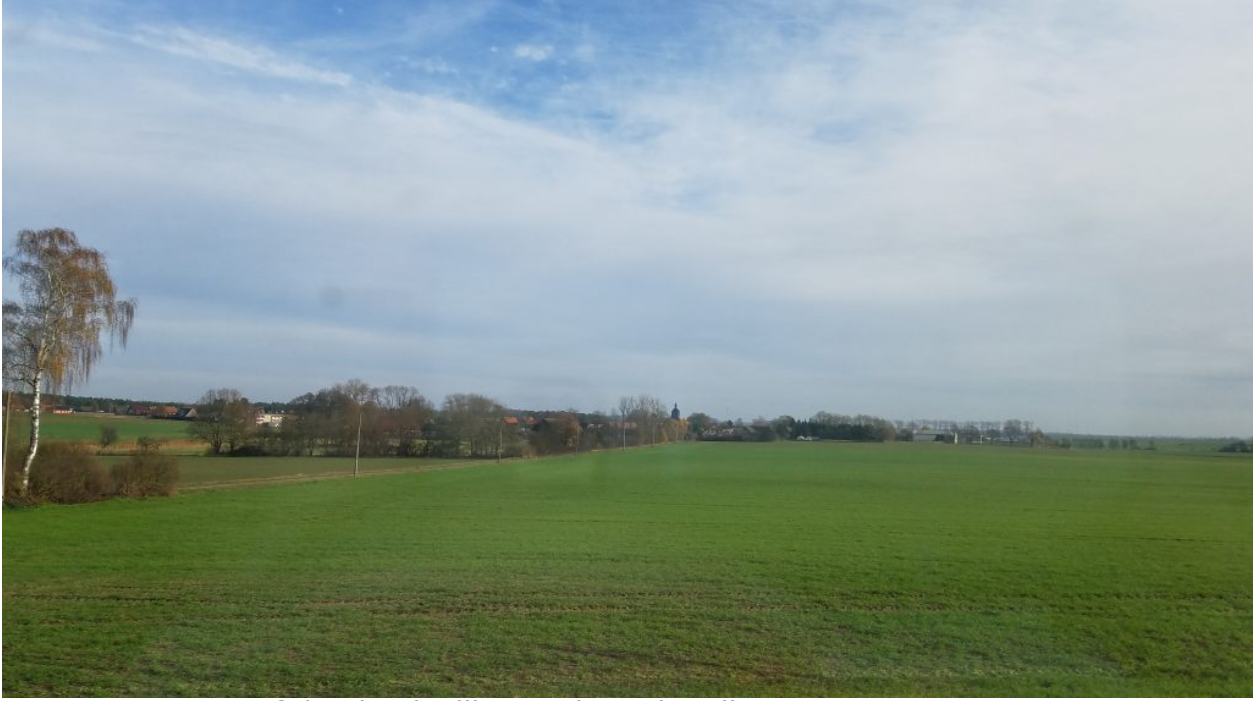
Now some snaps of riverbank villages along the Elbe,

As noted elsewhere, I took a train from Berlin to Prague on Sunday. Here's some snaps from that trip. These were taken with my phone, out the window of a fast moving train, so don't expect high quality. First a farm field.