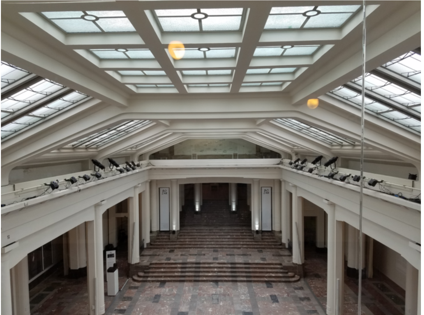
Here's some snaps I got in before being told not to (no signs) from Facing The Future .