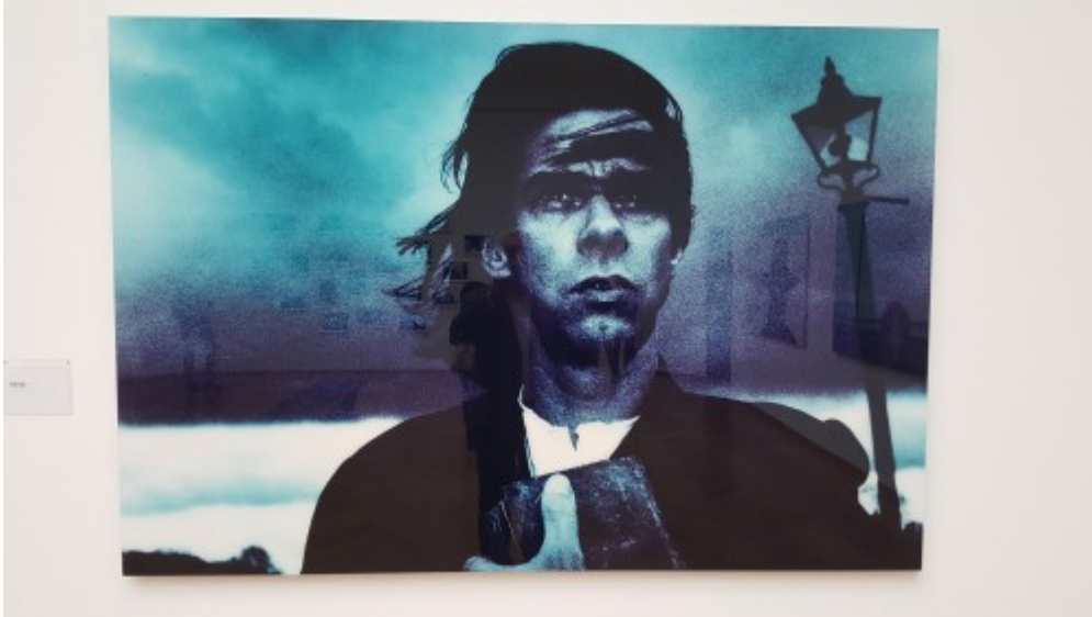
Nick Cave - 33 Still Lives (1999)