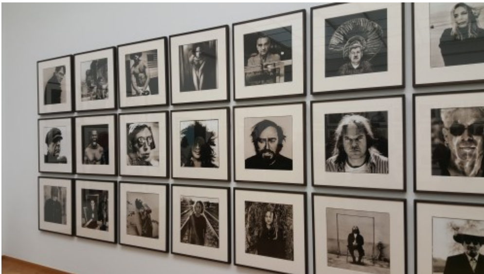
More people from Famouz