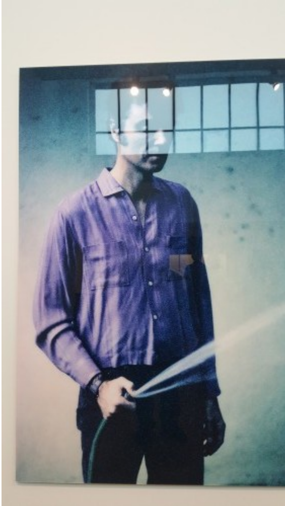
David Byrne - 33 Still Lives (1999)

You get the idea.Â But wait, thereâ€™s more.Â The subject is so huge that it spilled into the neighboring Fotomuseum, for the sister exhibition,Â 1-2-3-4 , where there were mostly portfolio of the different musicians heâ€™d worked with, such as: