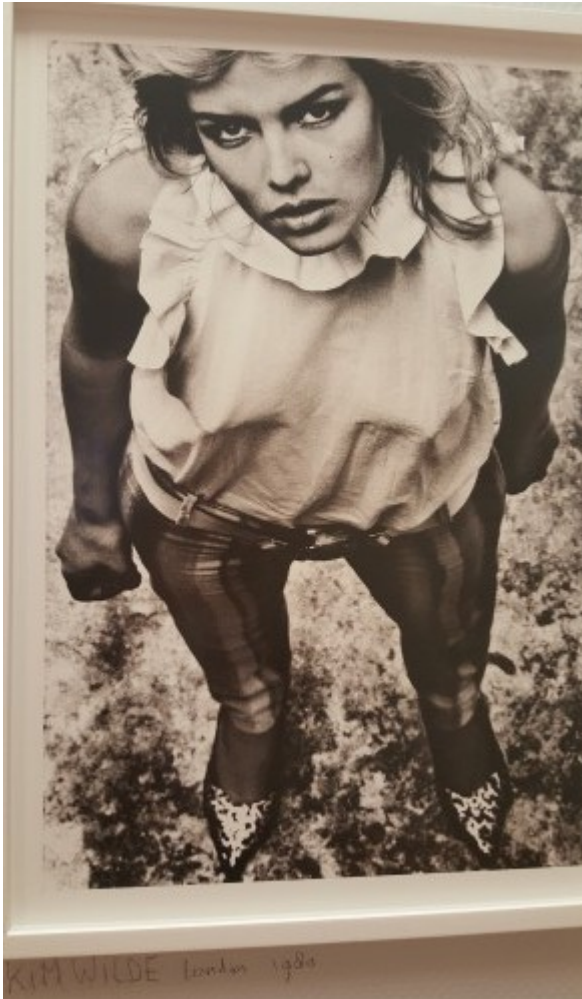
Kim Wilde - London 1980

It bears noting that the catalogues from these exhibits are extraordinarily well made, with thick pages and exquisite printing.Â No, I did not buy them (to haul home) but likely will (once I get back there).Â The two volumes, together, weigh about as much as my luggage for this trip. □