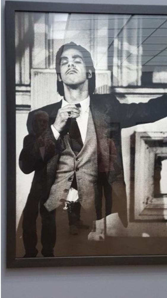
Nick Cave - London 1988