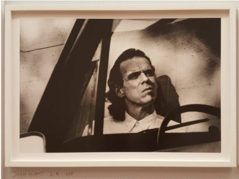
John Hiatt - LA 1988