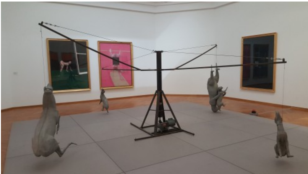
Bacon gallery with carousel – view II

GEM, the modern art museum, currently features an expansive exhibition of Charles Avery's work, entitled What's The Matter With Idealism? :