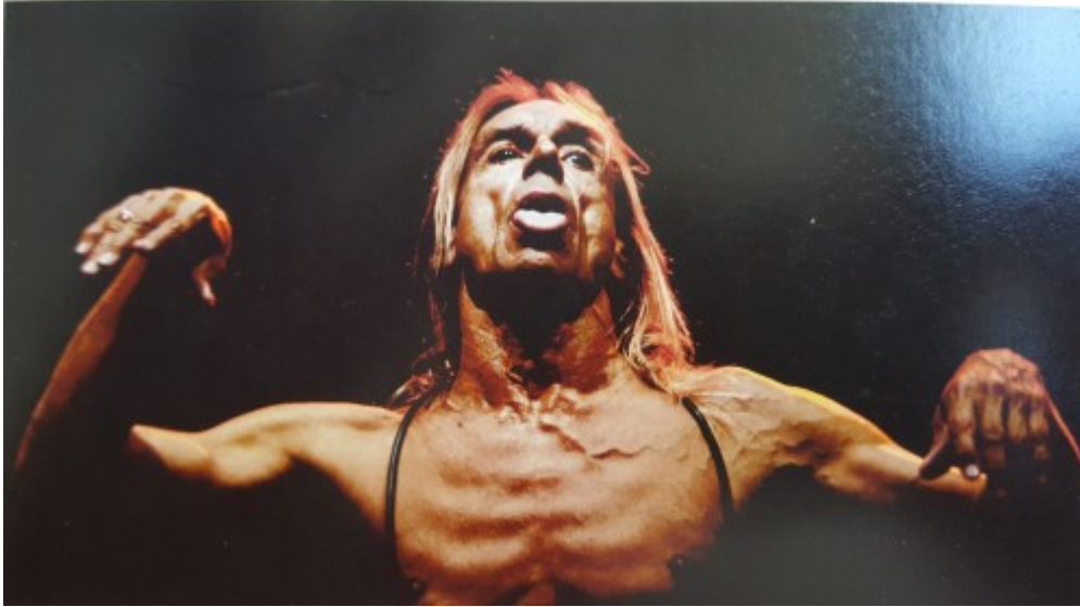
Iggy Pop & The Stooges