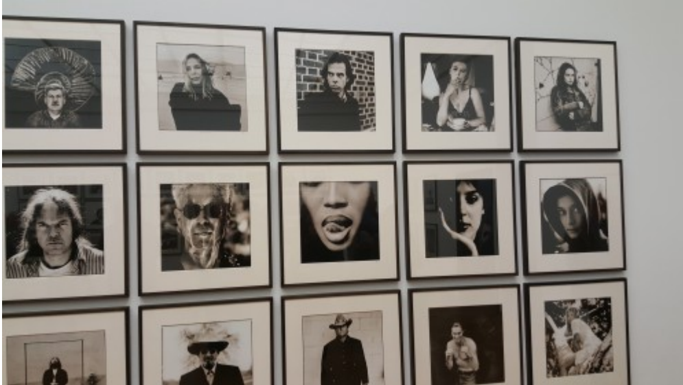
Assorted people from Famouz