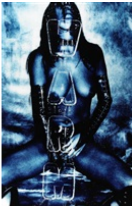
WARM - From Strippinggirls

Finally, there's the gift shops.Â At Gemeente Museum I grabbed a copy of strippinggirls , a joint effort between Marlene Dumas and Anton Corbijn, in which they went to the strip clubs of Amsterdam, met the performers, and produced both paintings (Dumas) and photographs (Corbijn) of them: