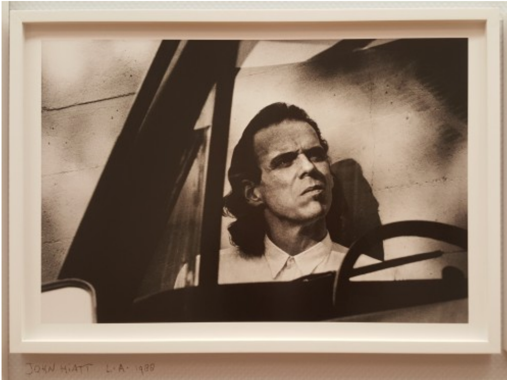
John Hiatt - LA 1988