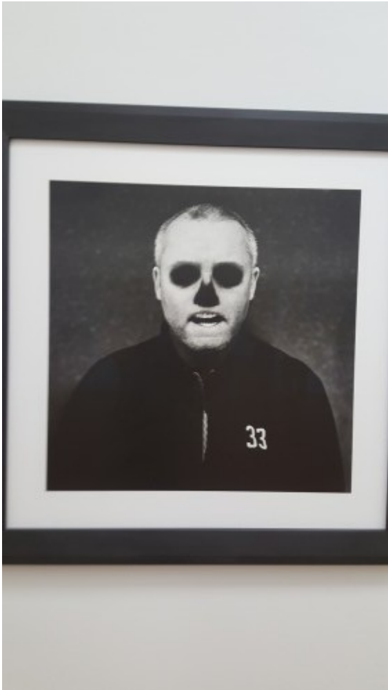
Damien Hirst - Everybody Hurts (2003)