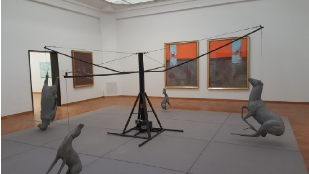
Bacon gallery with carousel – view I