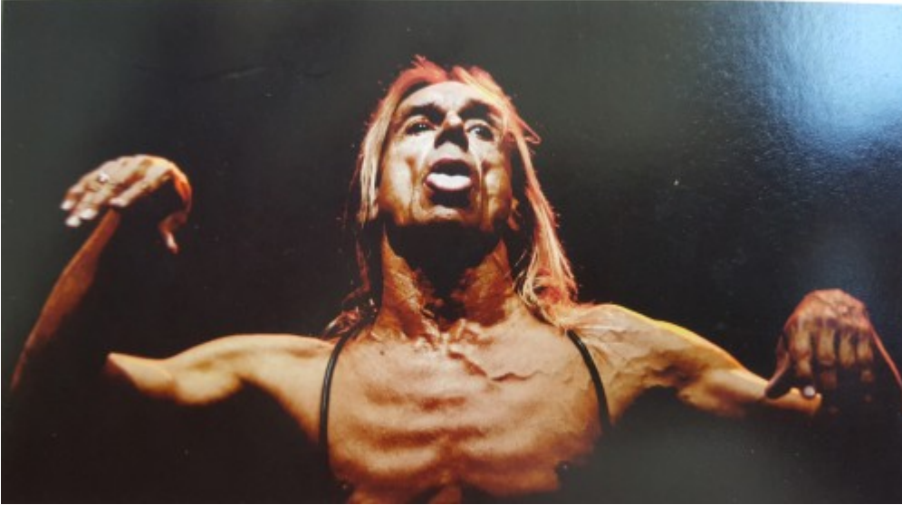
Iggy Pop & The Stooges