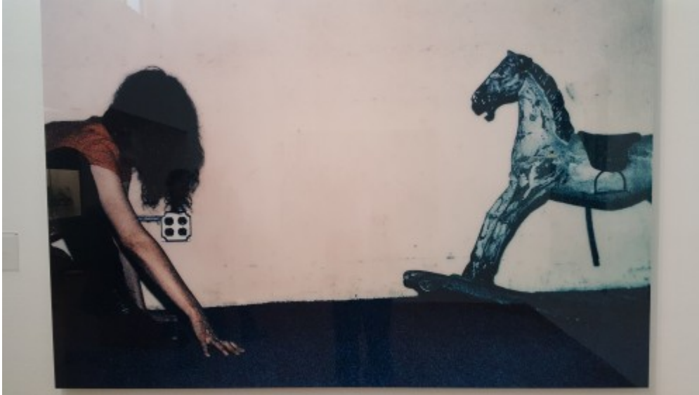
Patti Smith - 33 Still Lives (1999)