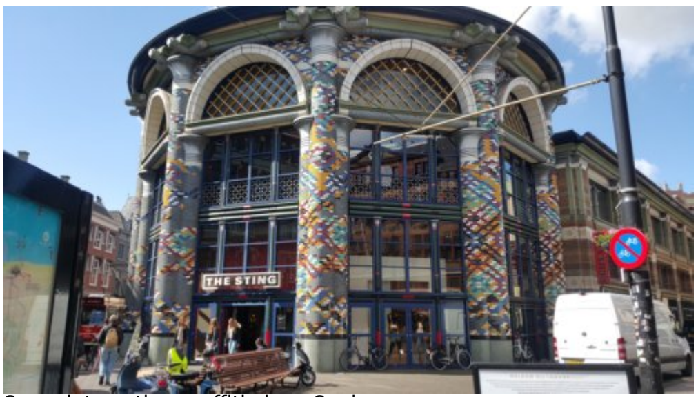
Some interesting graffiti along Spui: