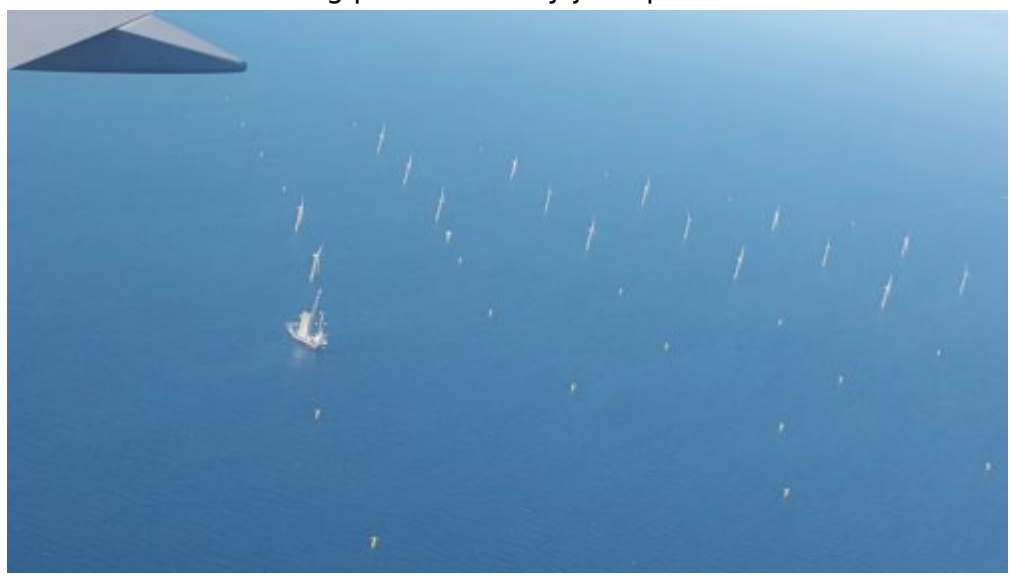
Windfarm and drilling platform in North Sea