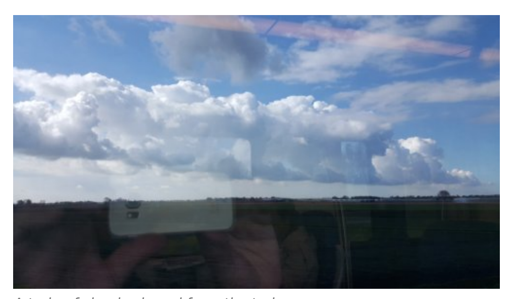
A train of clouds viewed from the train

A graffito's take on the Seven Deadly Sins