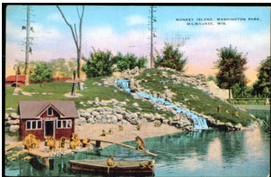
MONKEY ISLAND, WASHINGTON PARK, MILWAUKEE, WIS.