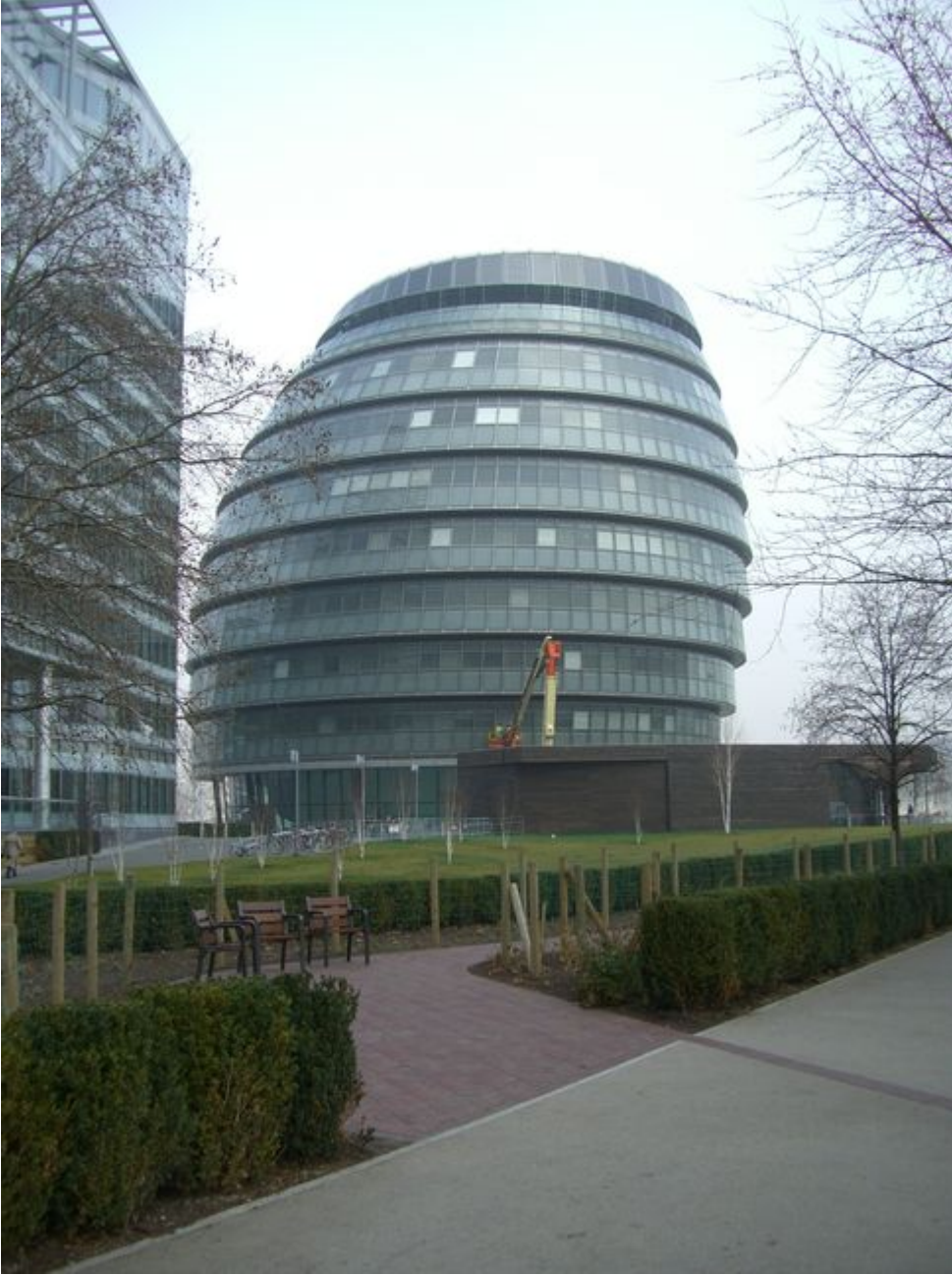
Here's Tower Bridge: