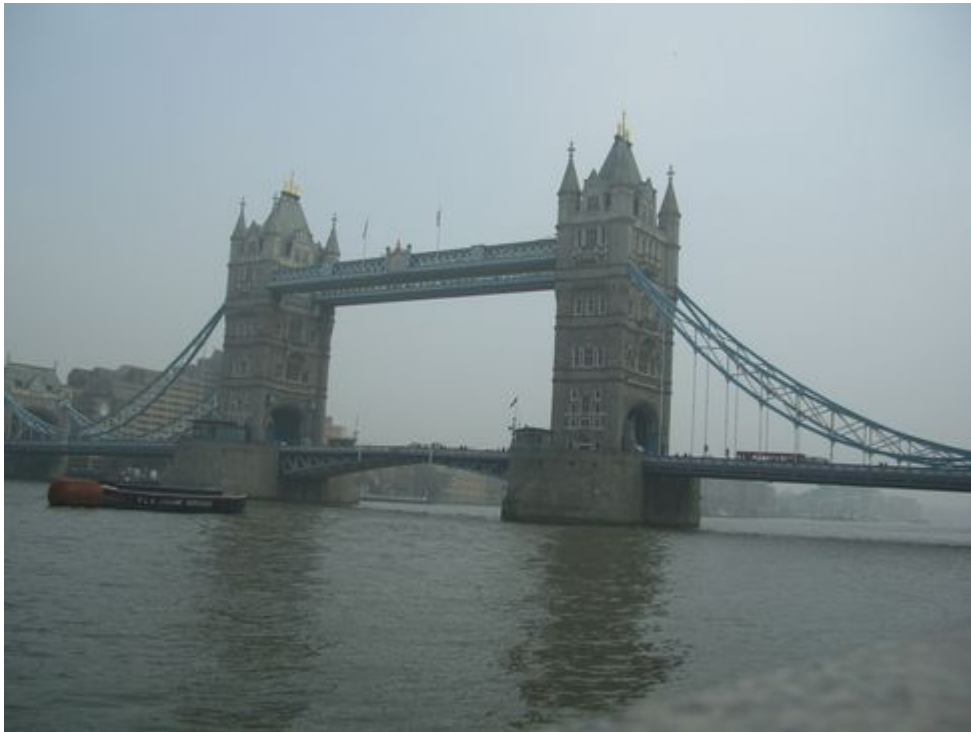
And here's the Tower of London"