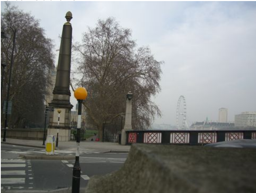
That's the Houses of Parliament in the distance on the left, Victoria Tower, and The London Eye towards the right. Houses of Parliament: