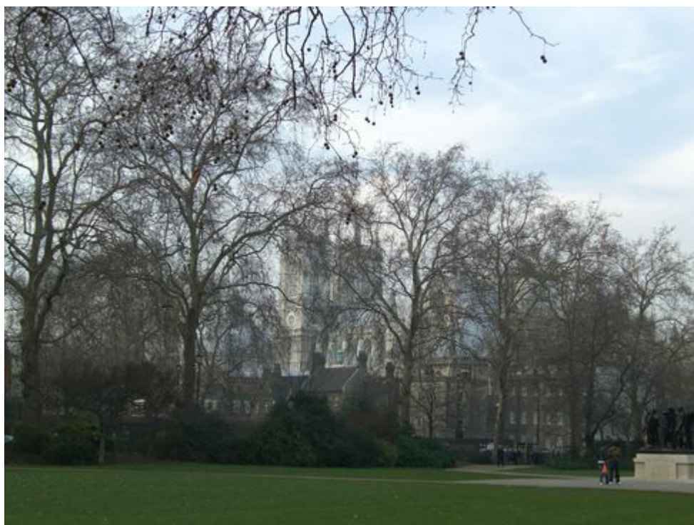
Stressed out sculpture by Whitehall: