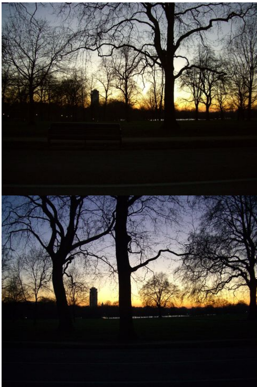
It was bloody cold out, so at Marble Arch I hopped onto a double-decker and headed back up to Marylebone. Here's shots from the top deck: