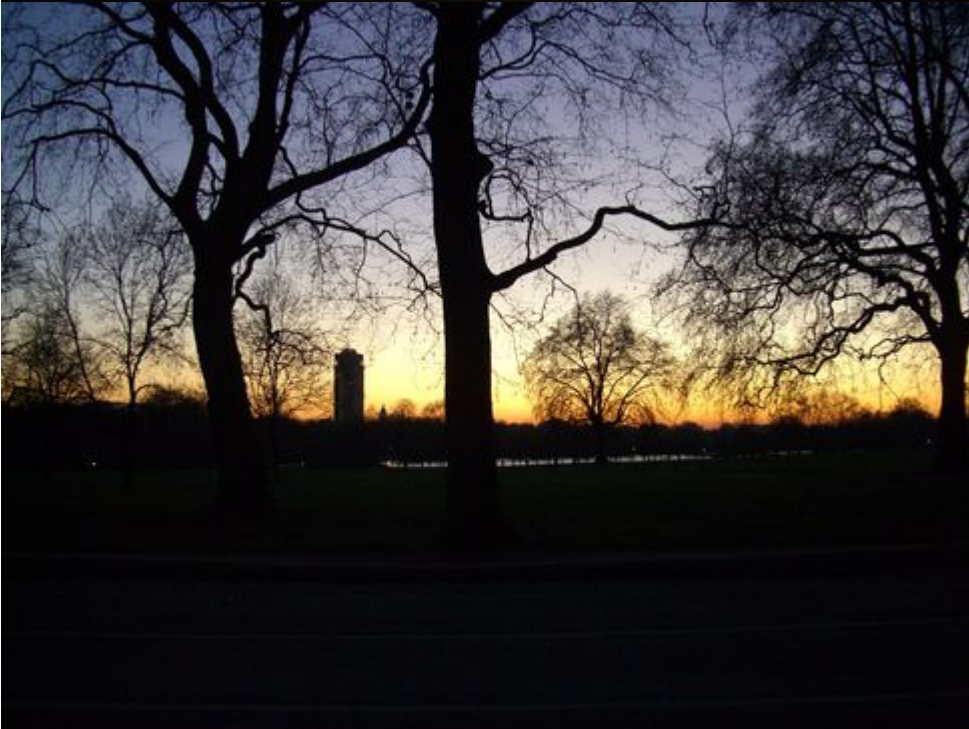
It was bloody cold out, so at Marble Arch I hopped onto a double-decker and headed back up to Marylebone. Here's shots from the top deck: