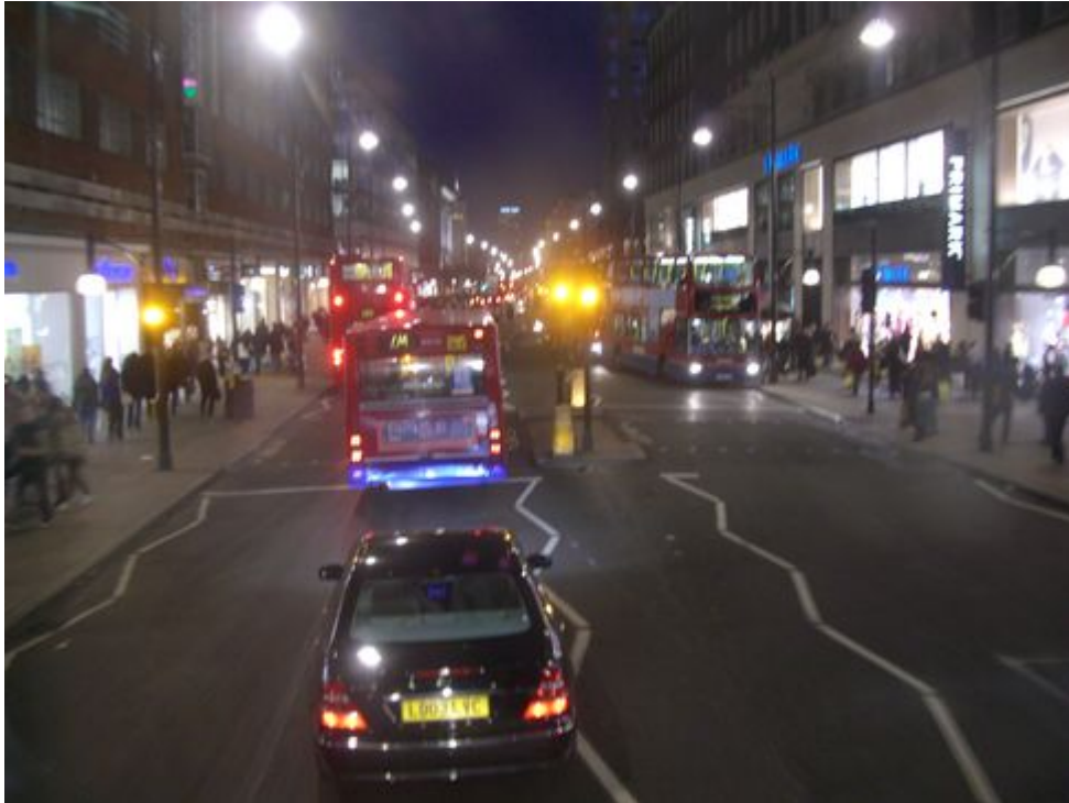
Home again, to write some more and rest up for the day of rest. Ta!