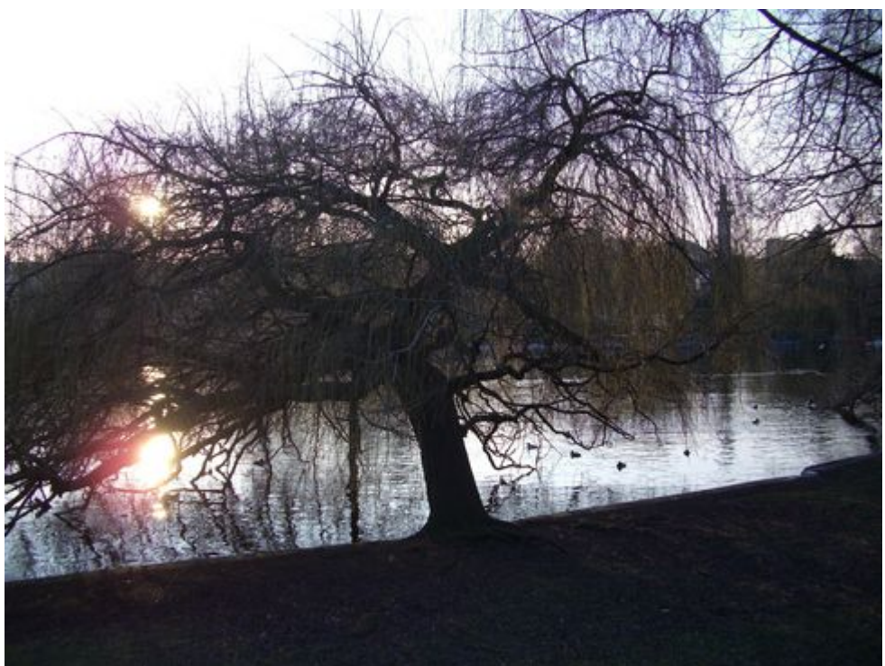
This little fellow was posing for another photographer, but I sneaked a shot The sunset over the London Central Mosque