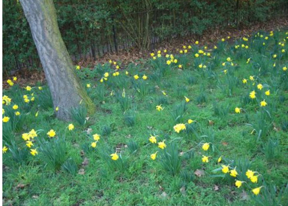
Due to my late start, the sun was starting to set