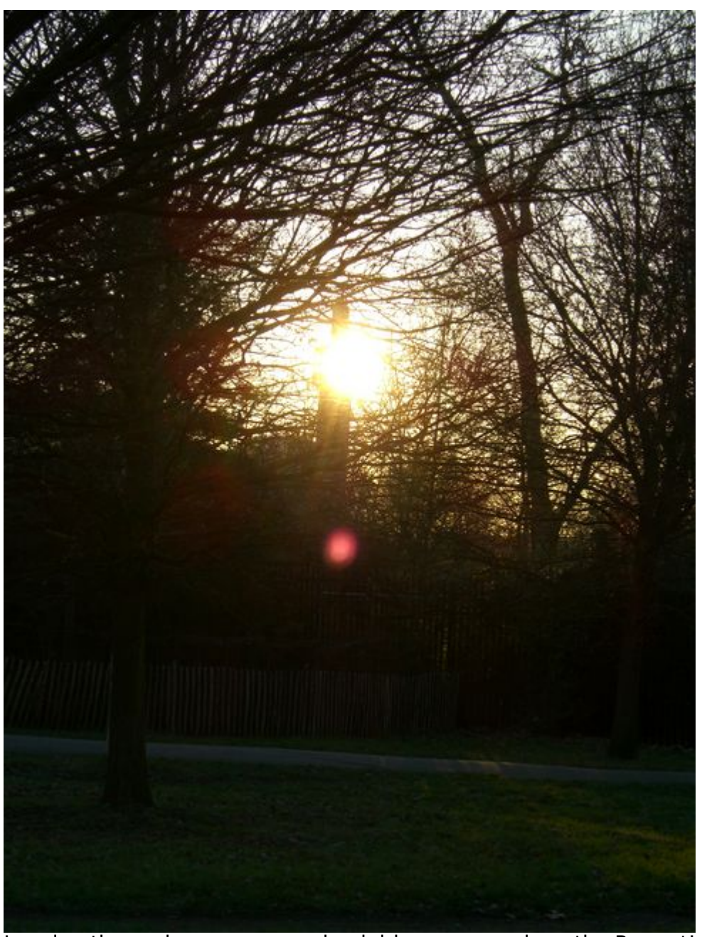
Leaving the park now, some schoolgirls scamper along the Regent's Canal