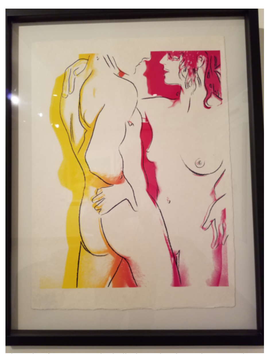
There is of course much similarity to be drawn between these two artists, and that is where the strength of this paired exhibition lies. Here are some side-by-side encounters: