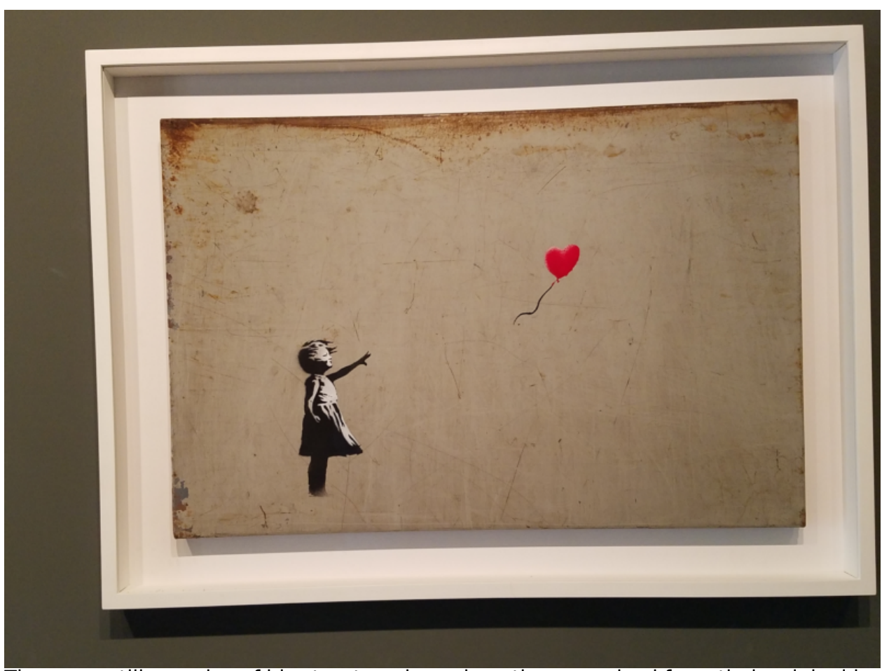
There are still samples of his street work, such as these, excised from their original locations: